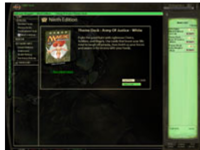
Video (9.6 MB QT File)

Take a look at the screenshots and video to see the new Online Store in action. By moving the store interface into the game client, we've made it easier and more convenient to browse and purchase product in Magic Online III . This also opens up new possibilities for other convenience features for the store, since it is now integrated with the rest of the game.